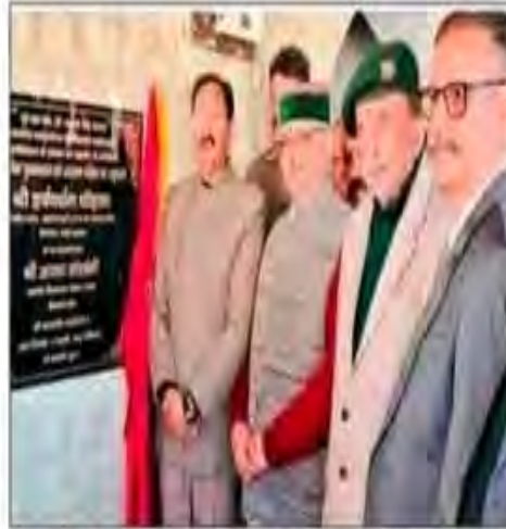
नाहन कॉलेज में सामुदायिक पुस्तकालय व अध्ययन परिसर का लोकार्पण करते उद्योगमंत्री व विभायक।