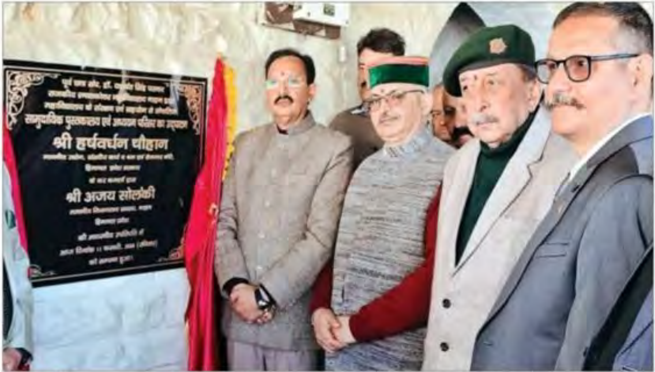
नाहन। सामुदायिक पुस्तकालय का लोकार्पण करते उद्योग मंत्री हर्षवर्धन चौहान, इस मौके पर विधायक अजय सोलंकी भी उपस्थित रहे