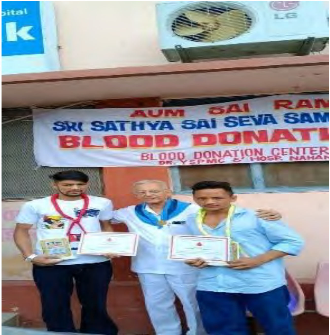
Students of R&R unit of the college donated blood at the blood donation camp organized by Sri Satya Sai Seva Samiti Nahan in Dr. Y.S. Parmar Medical College Nahan