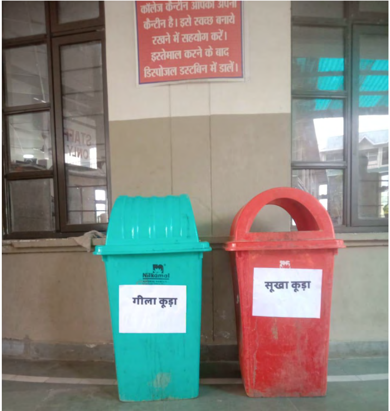
Photograph 2 separate dustbins for dry & wet waste in college

Separate dustbins for dry and wet waste are used in the college campus and canteen to manage the waste.