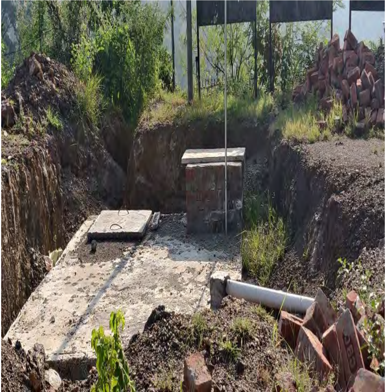
Photograph 4 Rainwater Harvesting Tank with connections for gardening