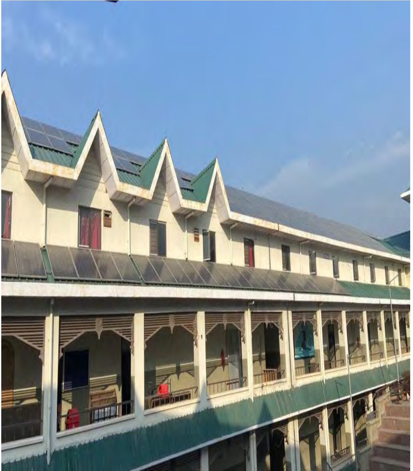
Photograph 1 Roof top Solar Panels Installed on the Roof of Arts Block