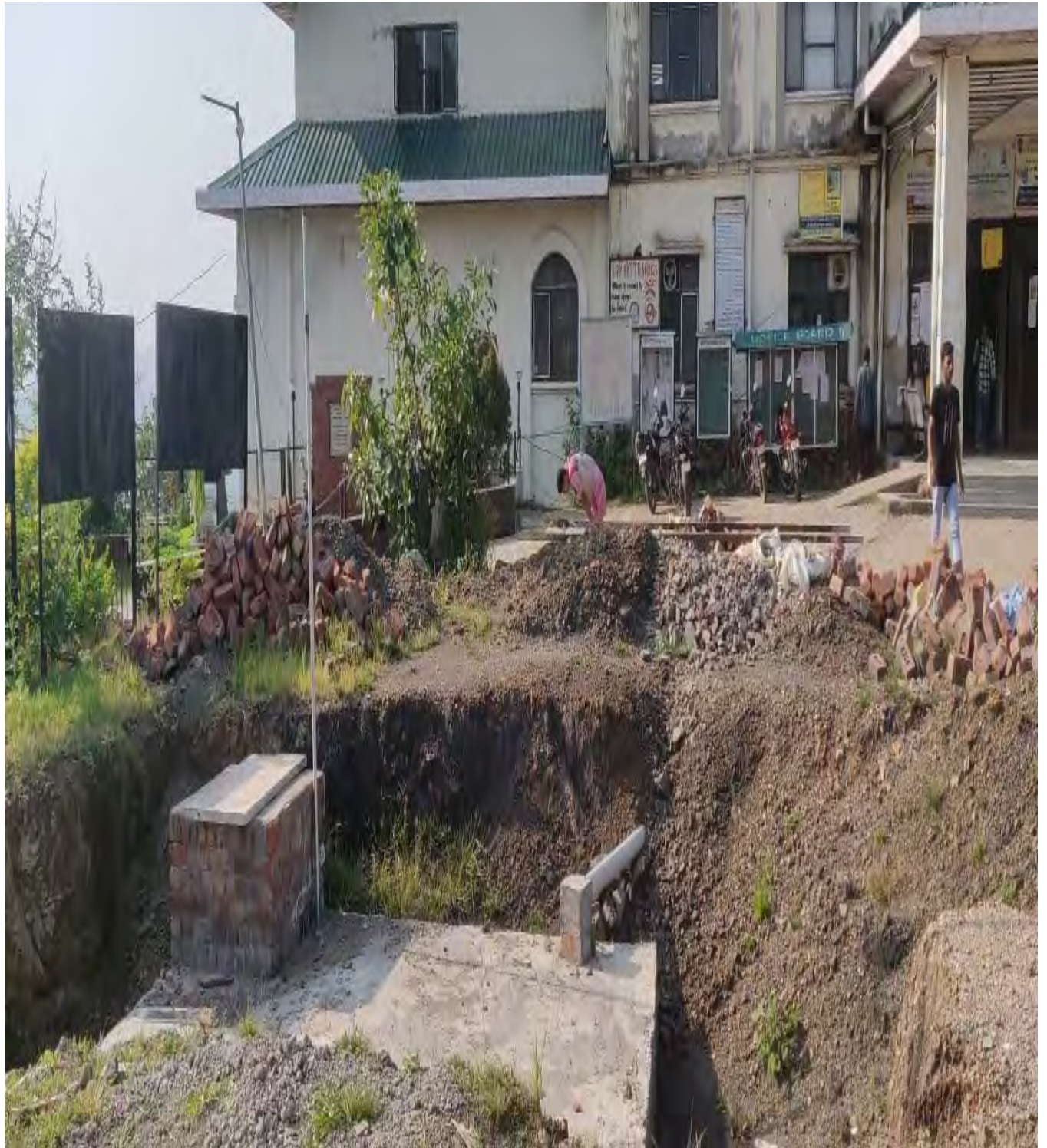
Photograph 3 Rainwater Harvesting Tank in the college ground near Yashwant Vatika