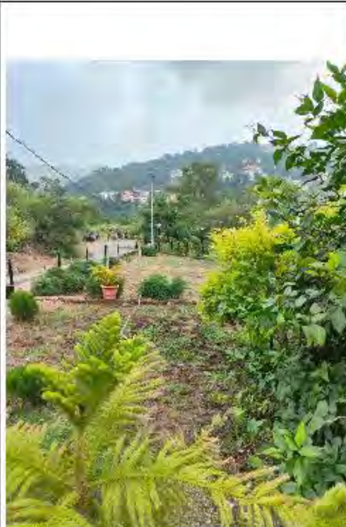
Figure 11: A picture of a new garden ( Yashwant Vatika ) in developmental stage